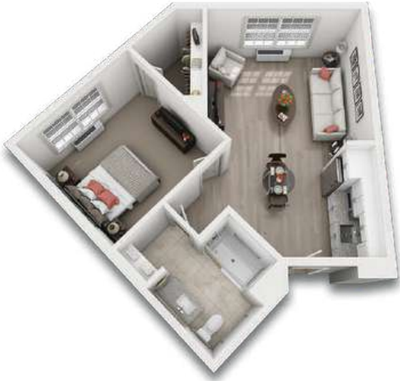
The Mayfair — 1 Bedroom/1 Bath