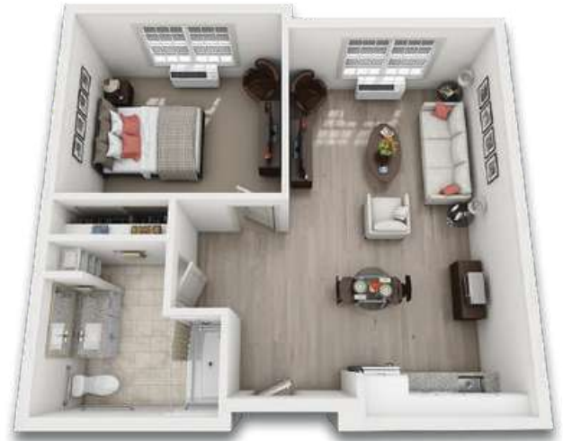
The Meadow — 1 Bedroom/1 Bath