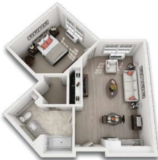
The Oakmont — 1 Bedroom/1 Bath