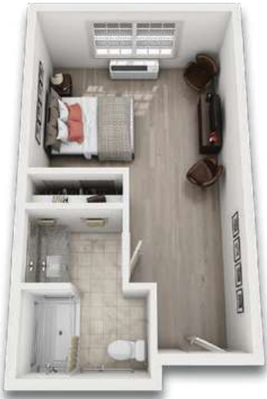
The Willow — Studio